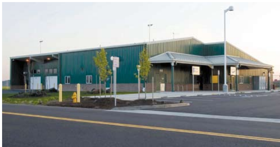
The air cargo building at the Eugene Airport was awarded LEED® certification by the U.S. Green Building Council.

A & M Auto Body is proud to announce that it is the first auto body collision repair shop certified green by EcoBiz. Short for Ecological Business Program, EcoBiz is a nationally established recognition program administered in state by pollution