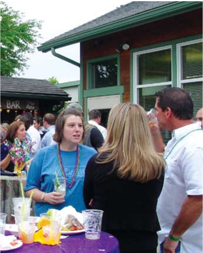
Professionals under the age of 40 enjoy the monthly Young Professionals Network events.

Greeters – Greeters is a committee of the Chamber whose mission is to promote networking opportunities, new business