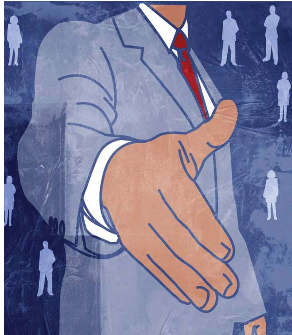
Illustration by Asbury Design